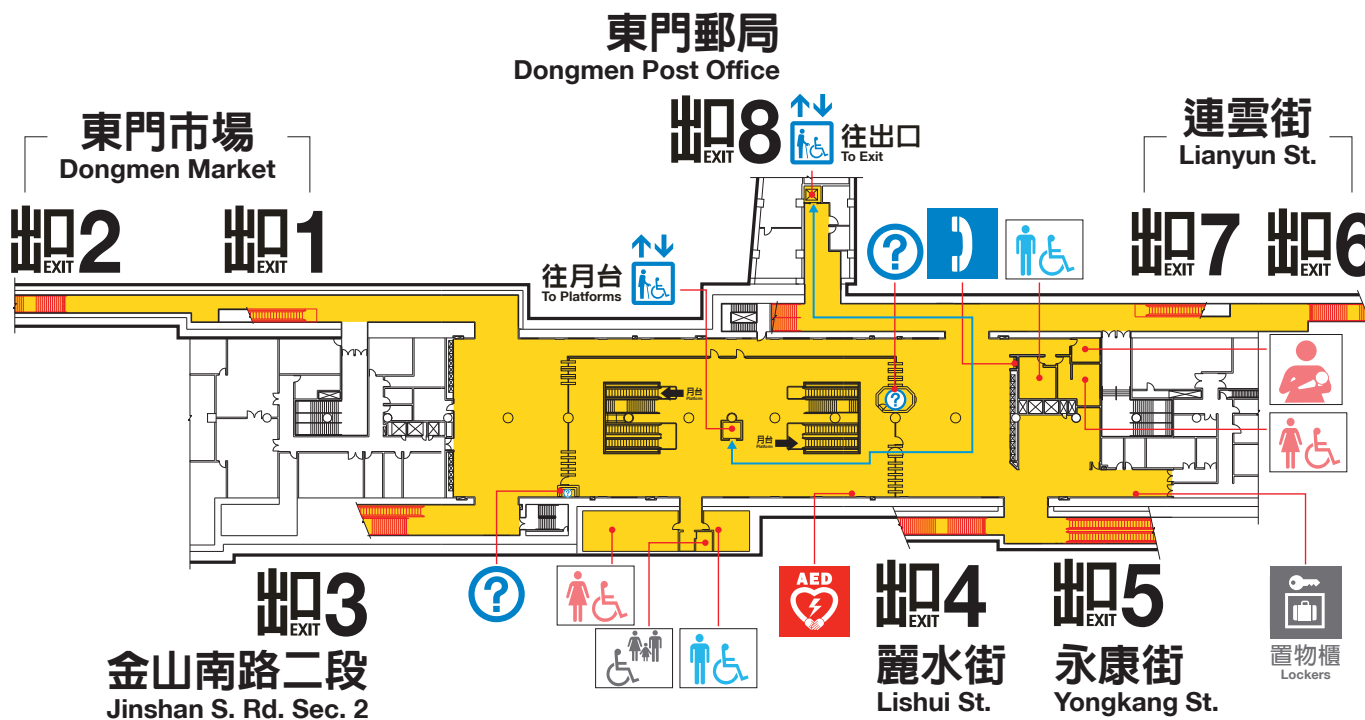
大廳層平面圖 Concourse Level