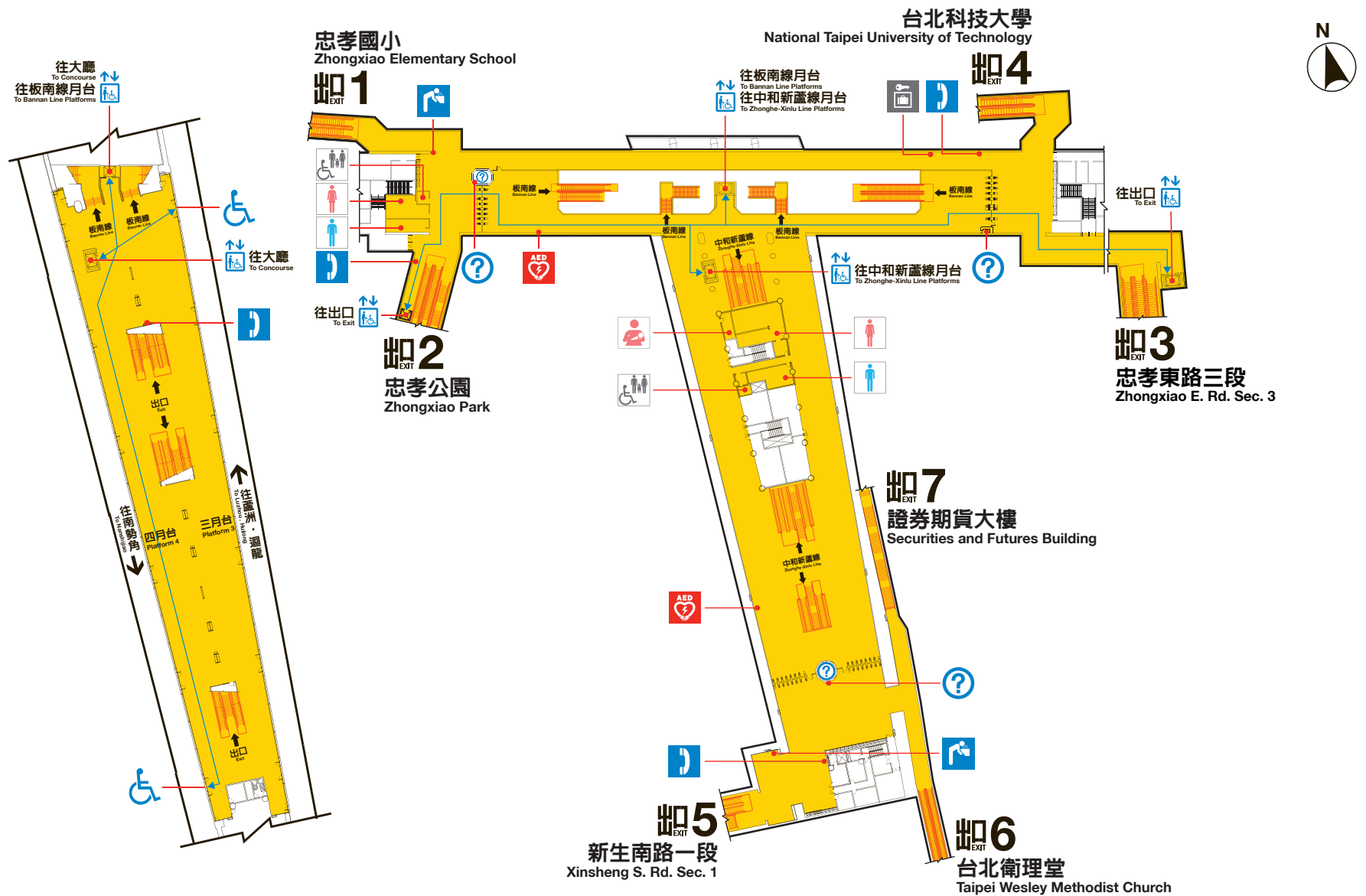
B3 中和新蘆線月台層平面圖 B3 Zhonghe-Xinlu Line Platform Level