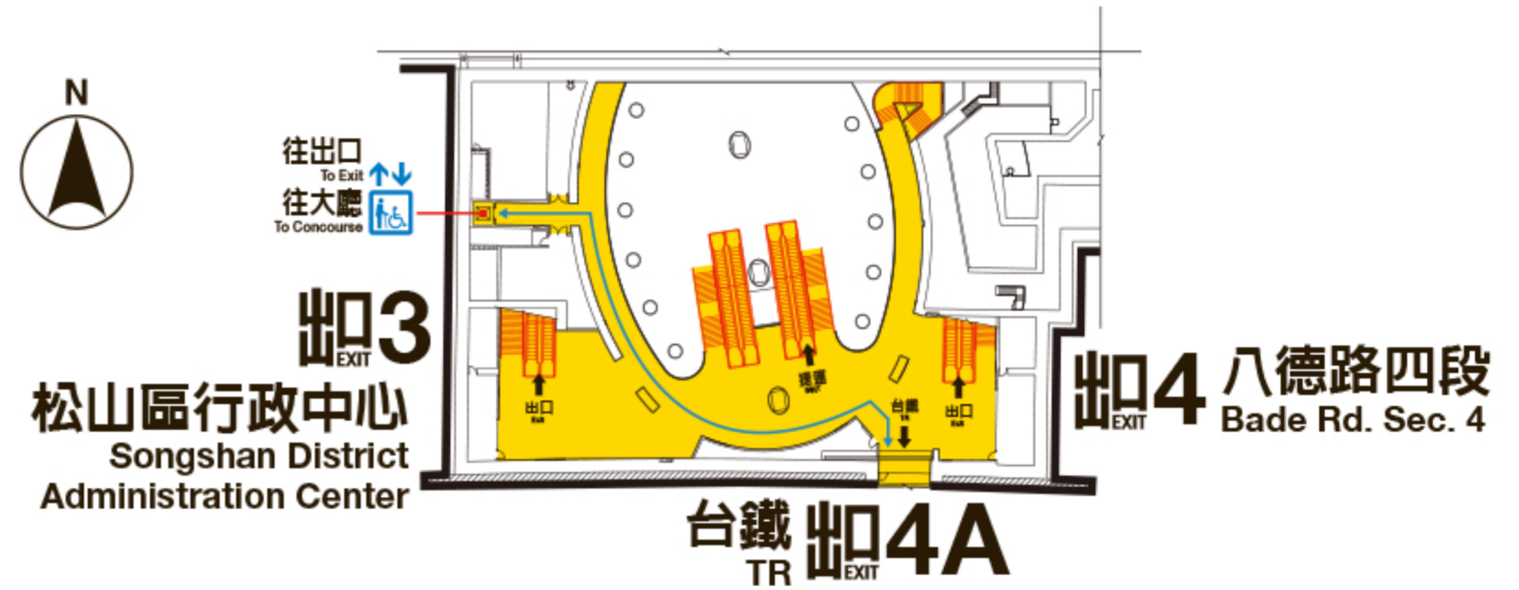
B1 連通道層平面圖 B1 Passage Level